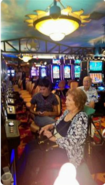
Or last casino outing last July for her 93rd Birthday